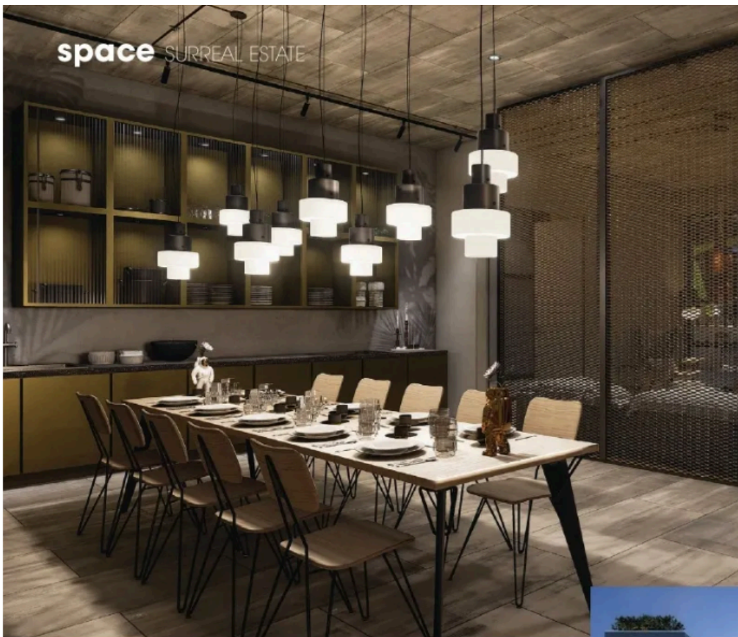
Clockwise from top left: Dining table in Diesel Wynwood's lounge; lobby area; exterior rendering of Diesel Wynwood.